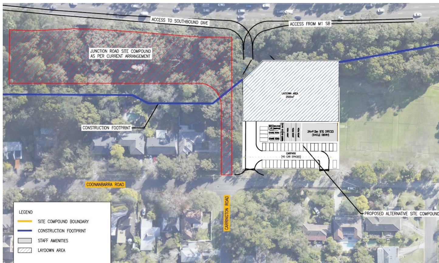
Proposed Carrington Park Compound site layout.

NorthConnex will also boost the state and national economies by providing more reliable journeys and shorter travel times for the movement of freight.