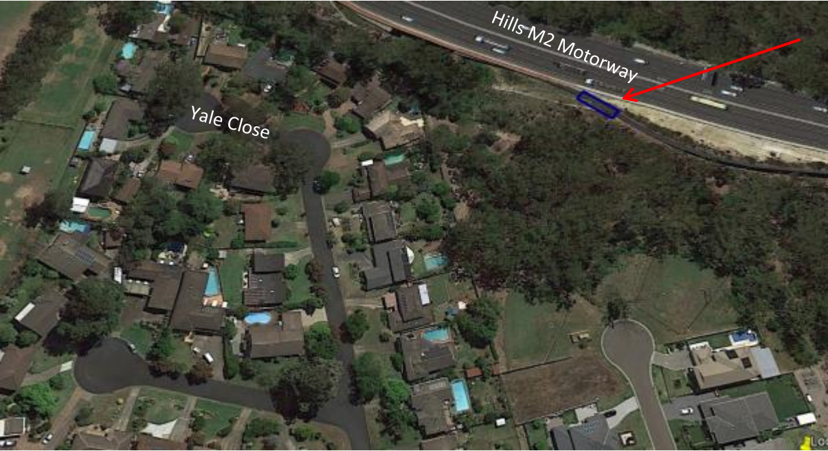
Map: Location of work – Adjacent to Yale Close Bridge