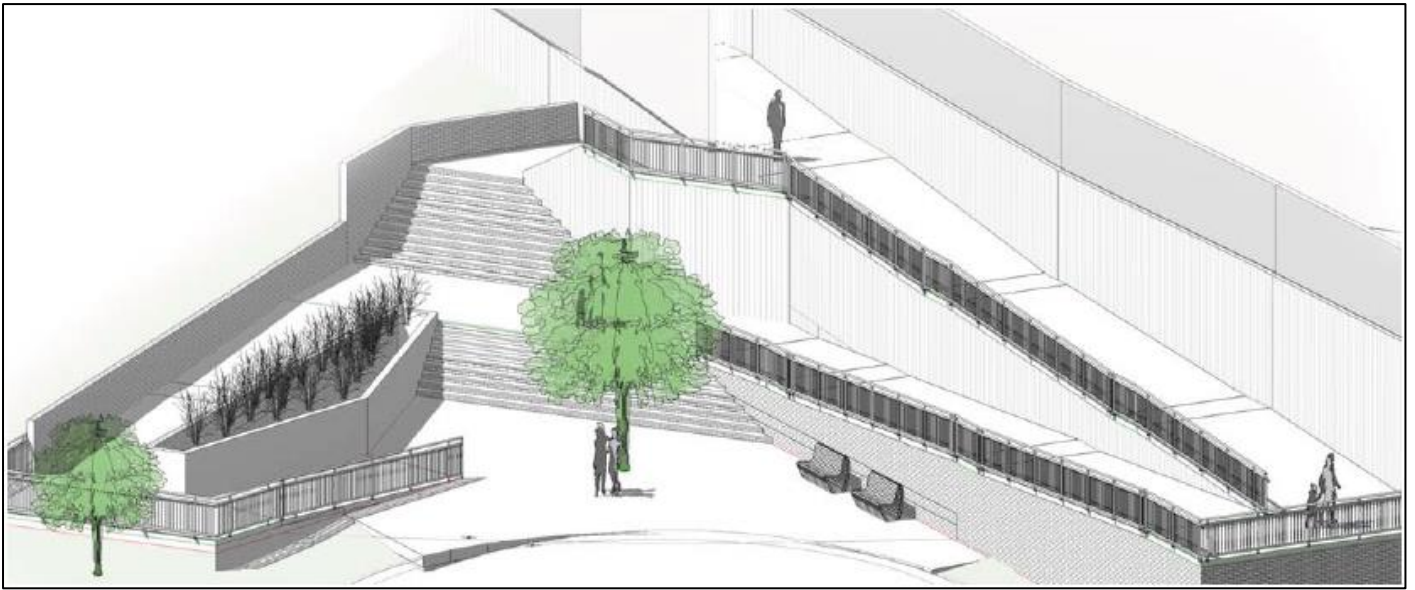
Hewitt Avenue shared path design proposed in UDLP1