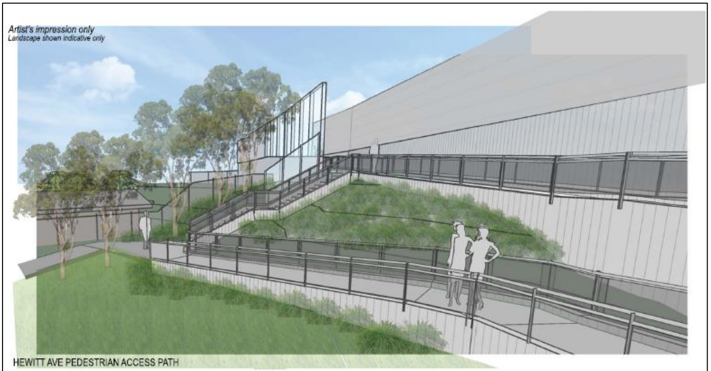
Hewitt Avenue shared path revised design proposal